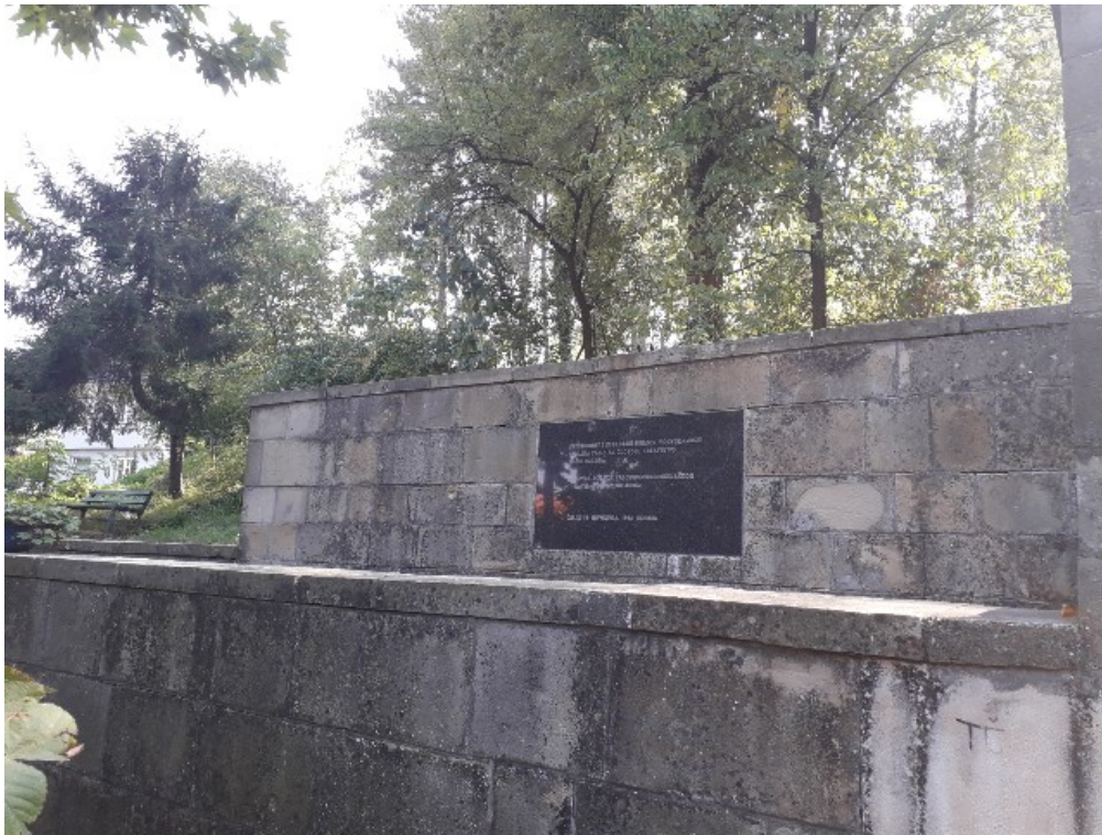
Figure 5a: Plaque at main entrance to memorial park, September 2018