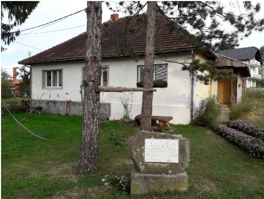
Figure 6a: Memorial plaque in garden, September 2018