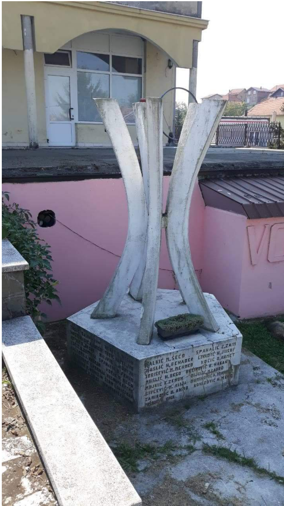
Figure 9c: Monument in its present-day location