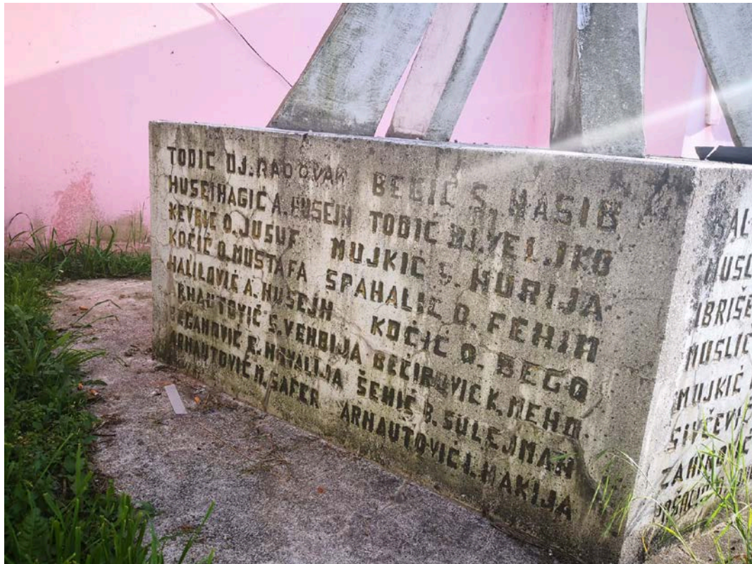
Figure 9d: Inscription around the base of the monument