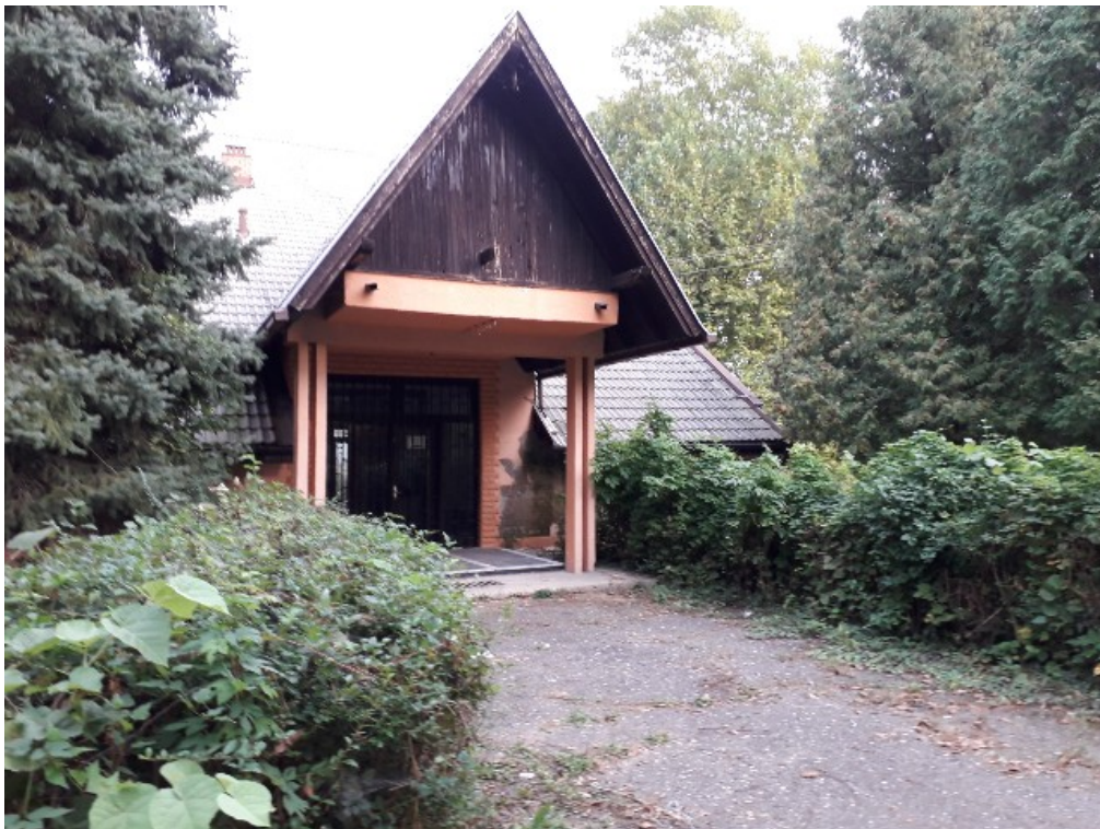
Figure 1b: Ahmet Kobić memorial house, September 2018