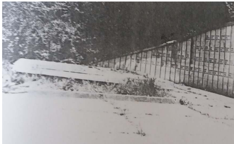
Figure 8b: Communal grave and memorial wall, 1980s