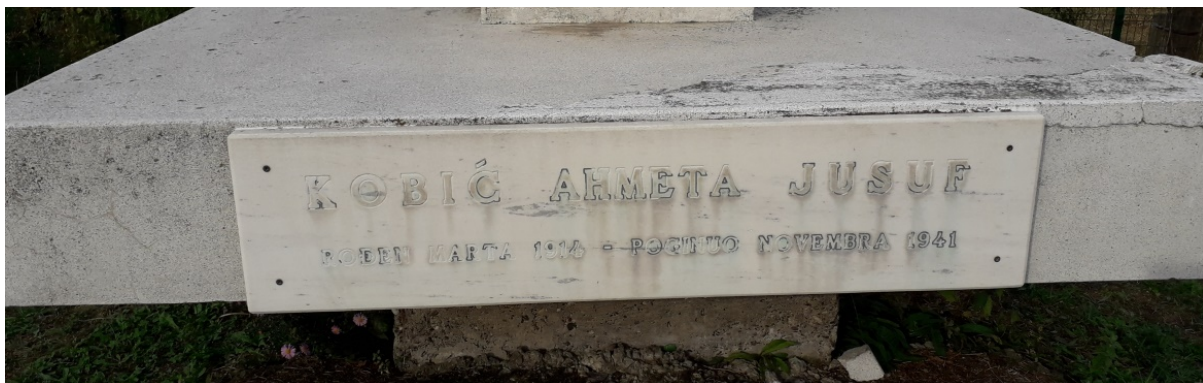
Figure 4b: Inscription on monument to Jusuf Kobić, September 2018

This monument lies on the outskirts of the settlement of Čelić, and was unveiled in 1982. The author of the monument is unknown. It is situated on an artificial mound, and approached by a small pathway, connected to a series of 11 concrete steps that lead up the mound.