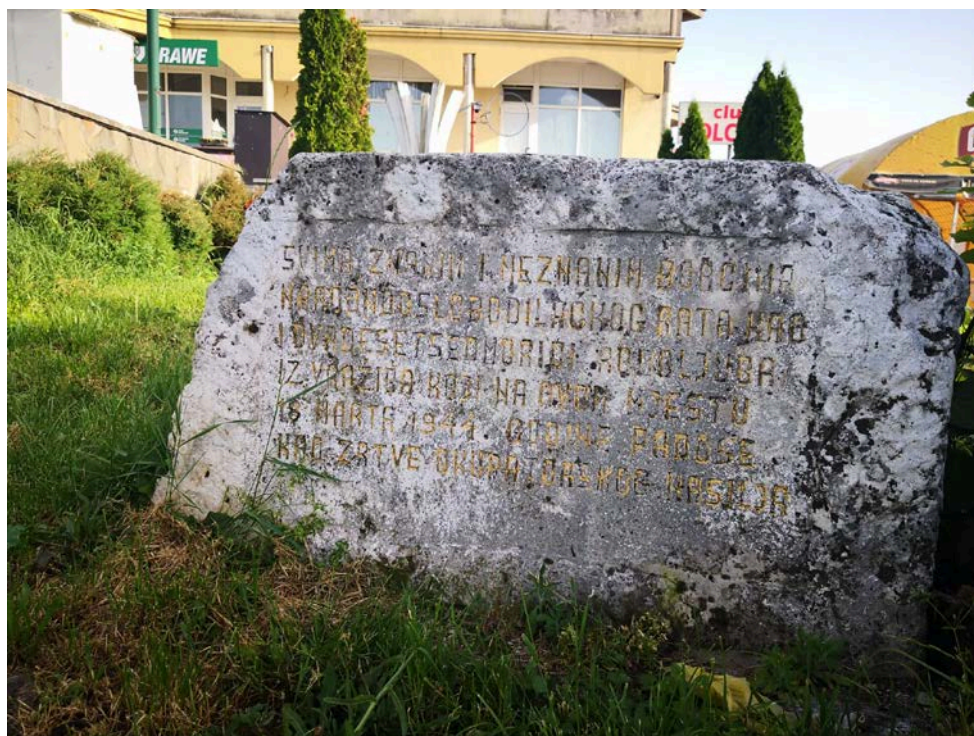
Figure 9e: Stećak today, with monument in the background