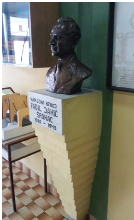
Figure 12b: Bust and pedestal, 2018