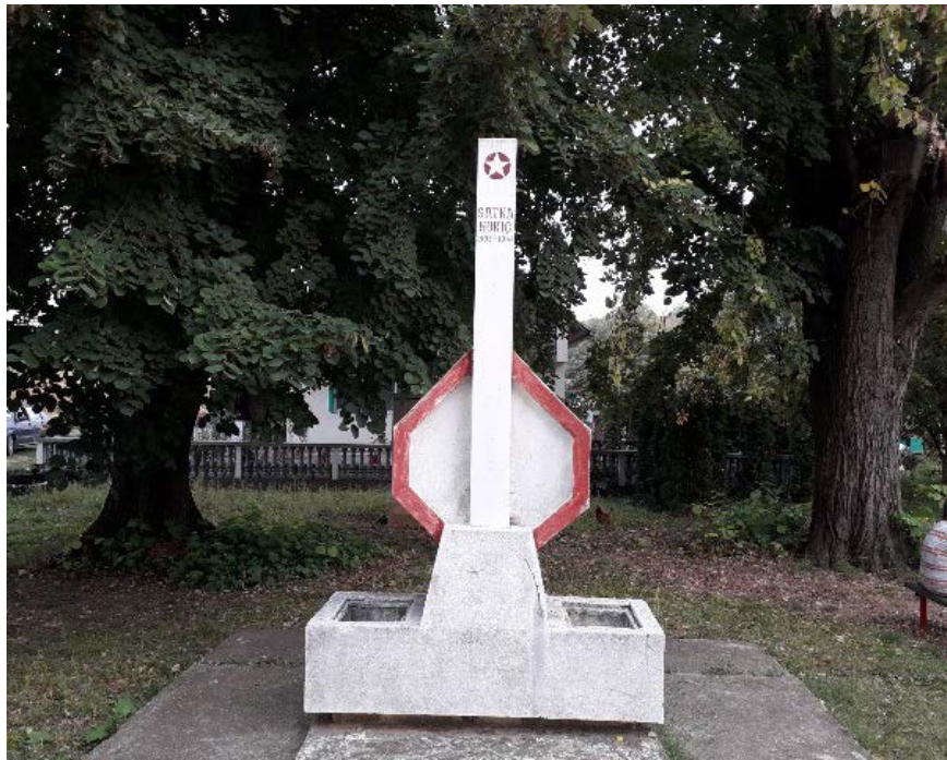
Figure 3a: Memorial fountain to Satka Nukić, September 2018