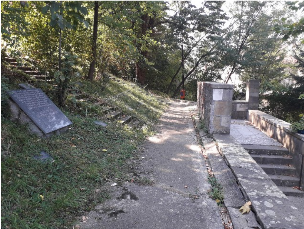
Figure 5c: Commemorative plaque, September 2018