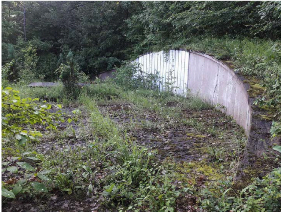
Figure 8d: Memorial wall and communal grave, June 2019