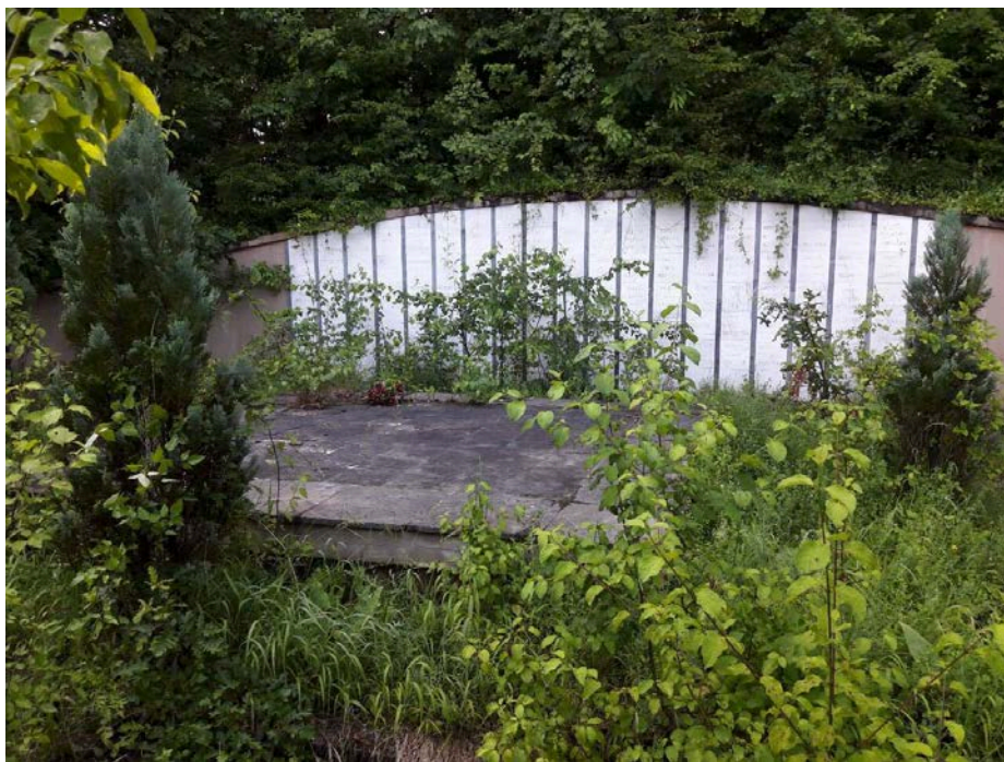
Figure 8e: Memorial wall, with communal grave in the foreground, June 2019

This collective grave lies within Šibošnica's memorial park. The date of its creation is unknown, although, due to the materials used, it is safe to assume that the memorial wall is contemporaneous to the nearby monument to Victims of Fascist Terror (see above, p.20), which it lies approximately 20 metres to the south east of.