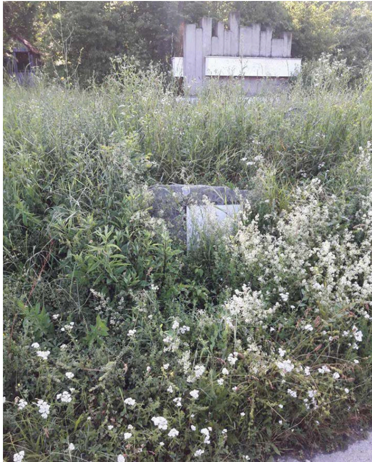
Figure 7c: Overgrown memorial plaque, June 2019

This monument lies on the outskirts of the village, and commemorates 128 Victims of Fascist Terror. No information could be found relating to the author of the monument or the date of its construction. The monument itself consists of thirteen vertical columns of concrete, of varying width and height, with two horizontal blocks, each encased in a white stone. The rear block is blank, while the front block is carved with the names of the people the monument commemorates. These names are in the form 'SURNAME, NAME', with no other information or separation between the names, making them difficult to read and interpret. The height at which the names are carved (slightly below chest height) further compounds this issue. The names inscribed on the monument (in the Latin alphabet) are as follows: