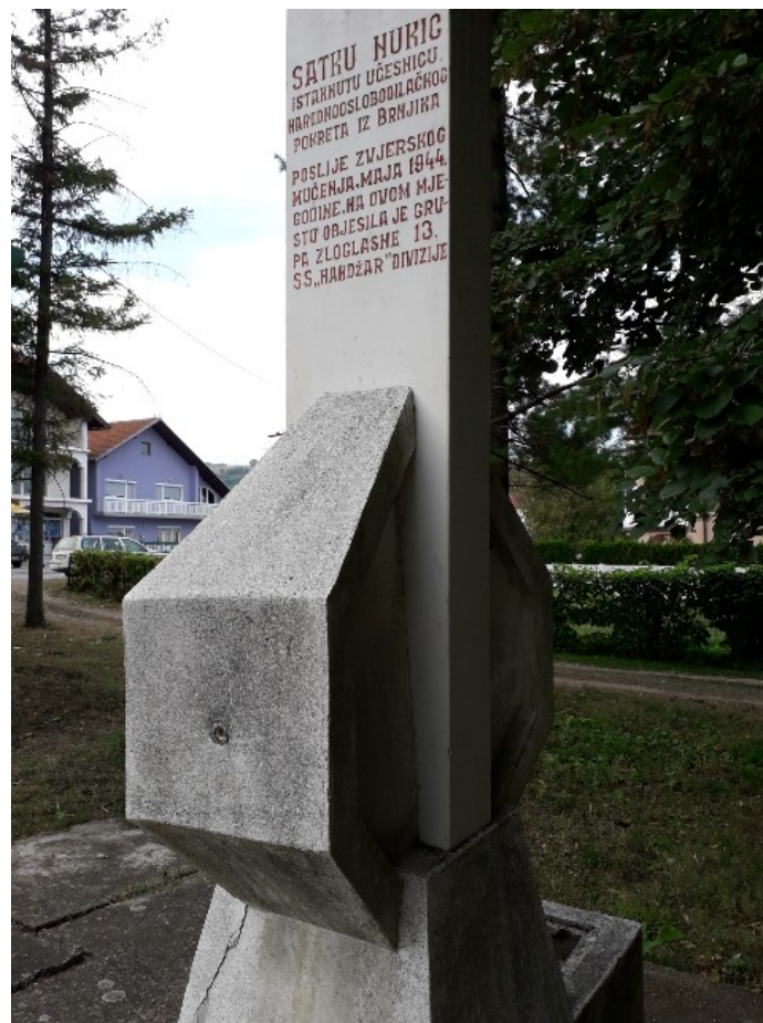
Figure 3b: Memorial fountain to Satka Nukić (detail), September 2018