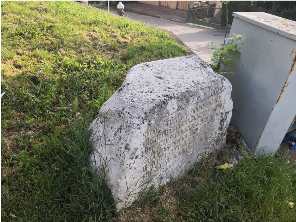
Figure 9f: Positioning of stećak today

This monument – whose artist is unknown – was unveiled at an unknown date, although it certainly pre-dates 1973; the date of the earliest photograph that could be found during the course of this research that depicts it. It consists of a pentagonal concrete base inscribed with names of 79 individuals. Above this, five concrete ribs join together to form an abstract decorative element. There is no text on the monument beside the names of those it commemorates.