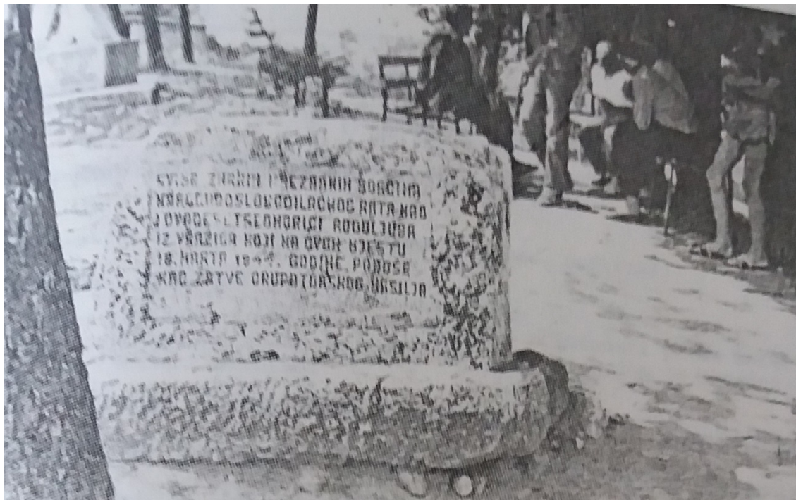
Figure 9b: Engraved stećak tombstone, with monument in the background, 1980s