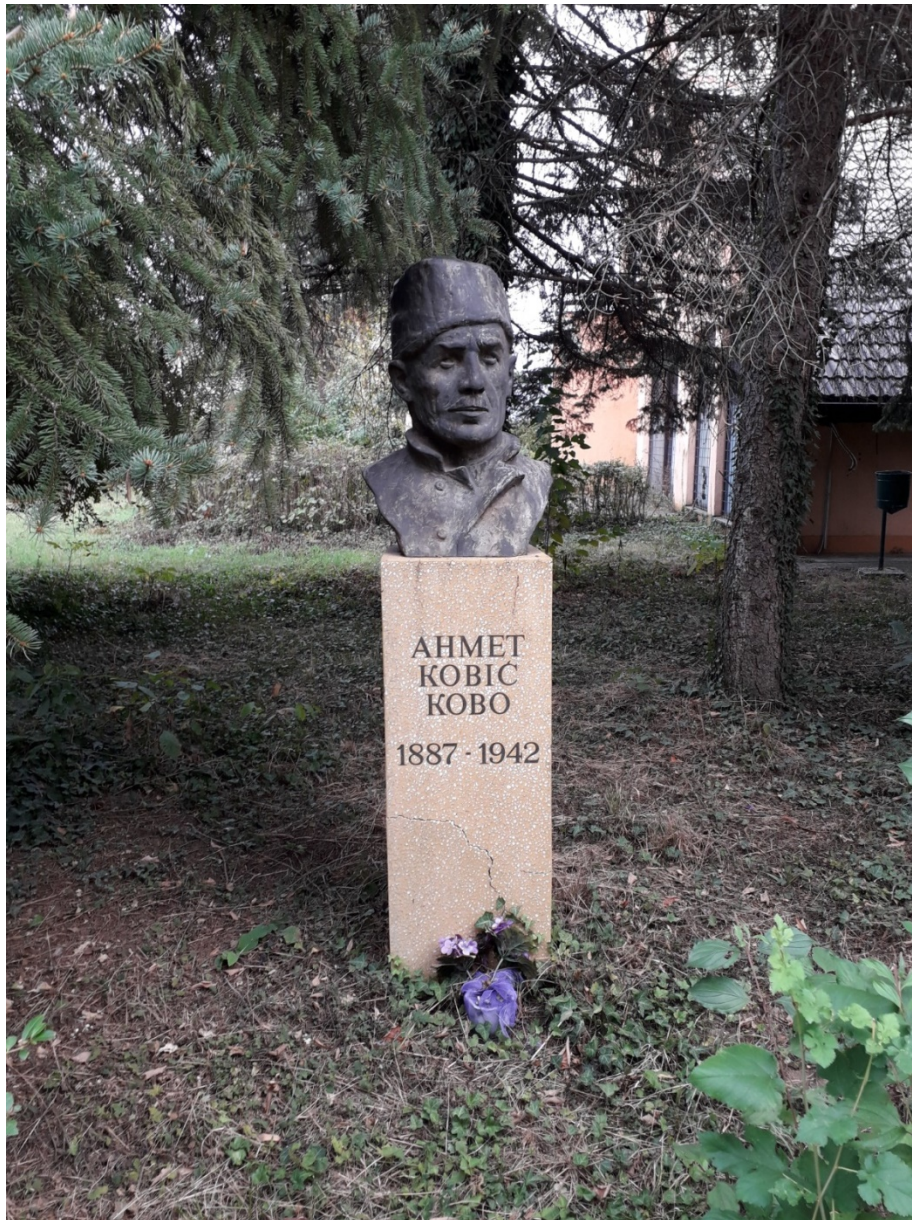
Figure 2a: Bust of Ahmet Kobić, September 2018

This bust was unveiled in 1983, and is the work of Zaim Mešić. The bust stands in front of the Ahmet Kobić memorial house in Brnjik. The bust and pedestal are both in excellent condition, and the surrounding parkland is relatively well maintained. A site visit in September 2018 showed evidence of flowers being laid in front of the bust in recent months. It is not known whether these were laid by an individual or as part of an organized commemorative event.