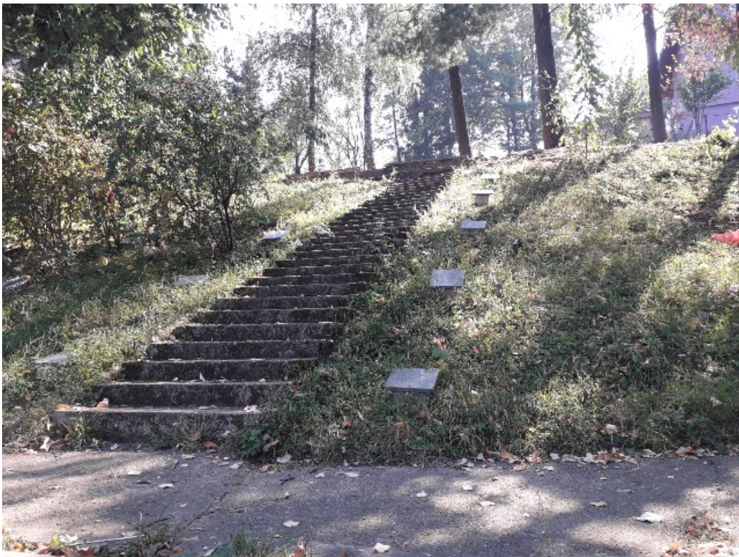
Figure 5d: Stairway with memorial plaques on either side, September 2018