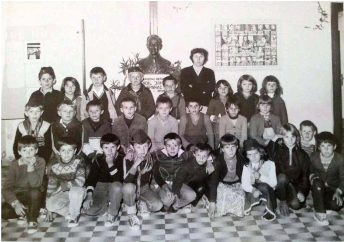
Figure 12a: Bust of NH Fadil Jahić Španac, Vražići, c.1982