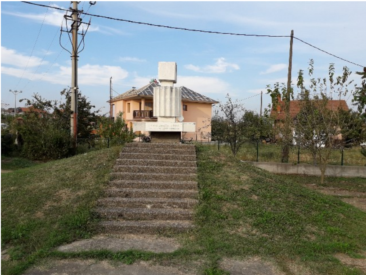
Figure 4a: Monument to Jusuf Kobić, September 2018