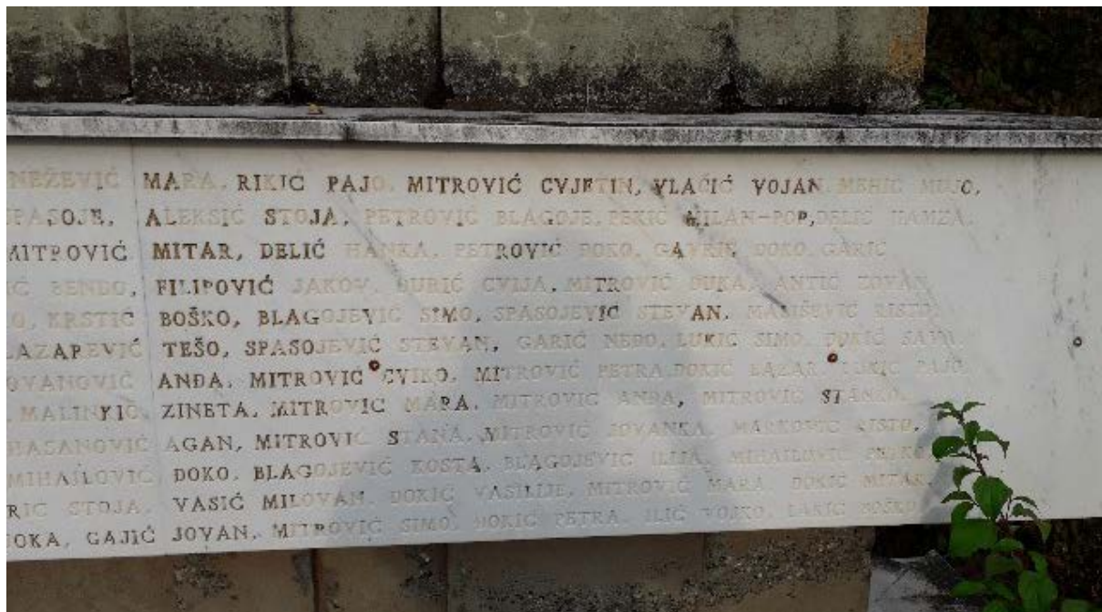
Figure 7b: Detail of inscription