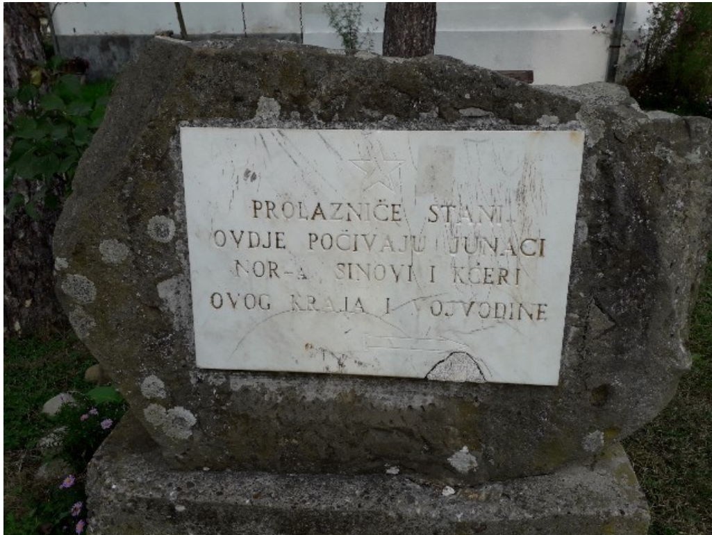
Figure 6b: Close-up of memorial plaque, September 2018