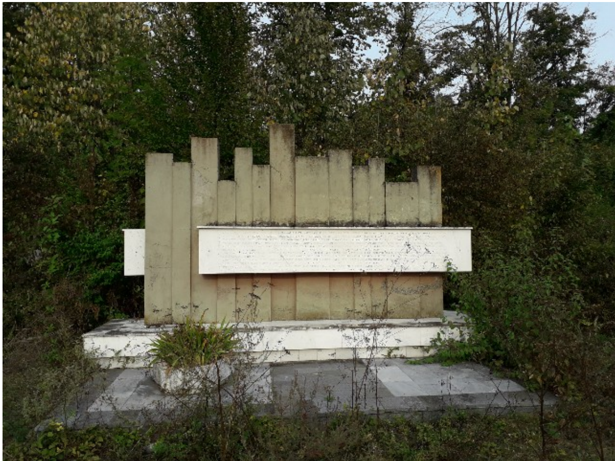
Figure 7a: Monument to Victims of Fascist Terror, September 2018