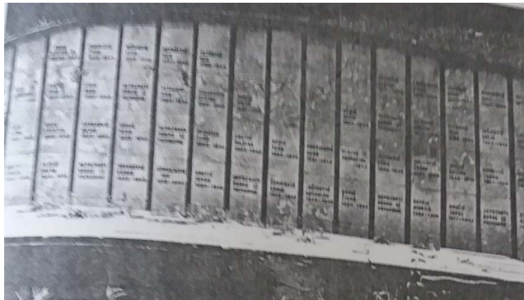
Figure 8a: Memorial wall, 1980s