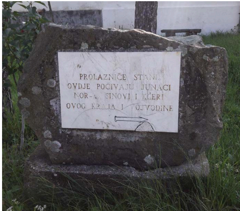
Figure 6c: Close-up of memorial plaque with arrow now in-filled, June 2019

This memorial plaque lies in the village of Šibošnica, approximately 150 metres to the north-west of the monument to Victims of Fascist Terror (see below, p.20). The date of its creation and the person or group who made it are unknown. The memorial consists of a small marble plaque set into a stone, which, in turn is set upon a small cuboidal concrete base.