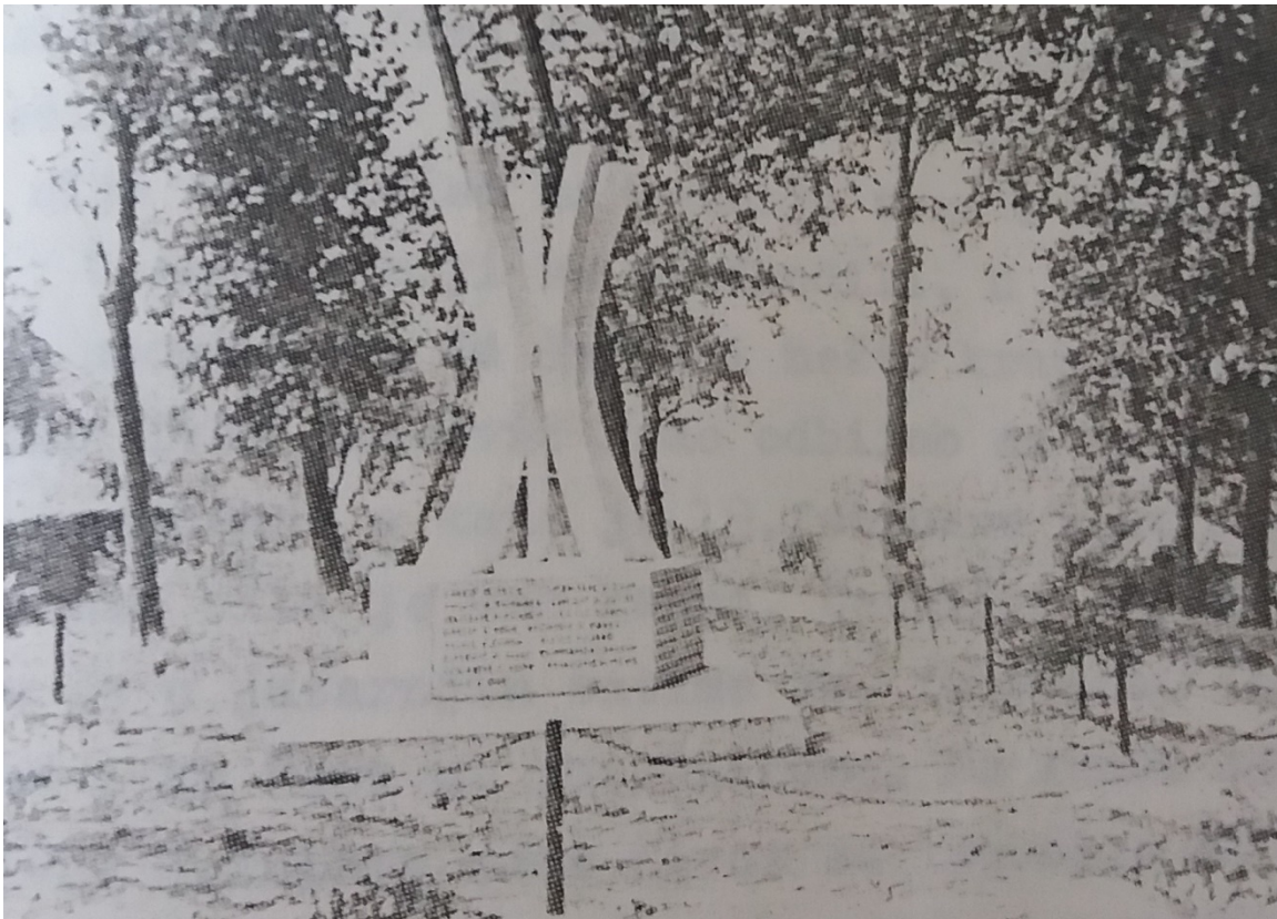
Figure 9a: Memorial in its original location, 1980s