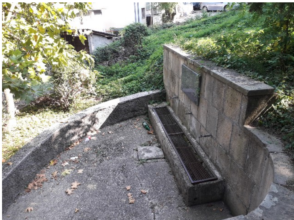
Figure 5b: Memorial fountain, September 2018