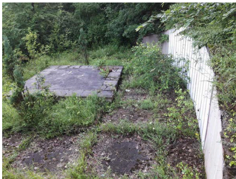
Figure 8c: Memorial wall and communal grave, June 2019